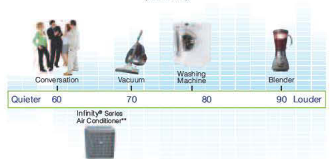
Comparison Sound Ratings (decibels)

Infinity two-stage air conditioners quietly cool your home with sound levels as low as 66 dBA. Our exclusive Silencer System II™ features a silencer top, integrated fan motor, forward-swept fan blades, compressor vibration isolator plate, sound hood and split-post compressor grommets to help deliver quiet operation by maximizing airflow and minimizing vibration.